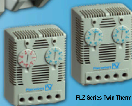
FLZ Series Twin Thermostats

The combination of the Filterfans from the 4th Generation and the FLZ series thermostats promotes the intelligent, cost effective use of resources by promoting energy efficiency by cooling according to requirement and thus reducing CO 2 emissions.