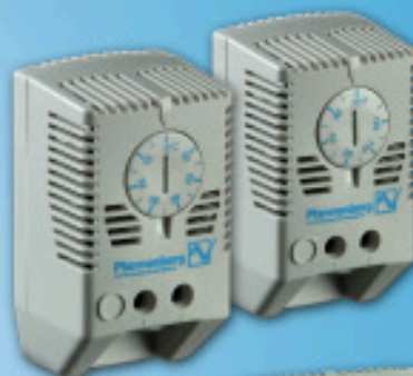
FLZ Series Thermostats